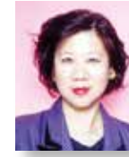
Wong Wai Sum 黃慧心 Senior Government or Statutory Board Official (1123)