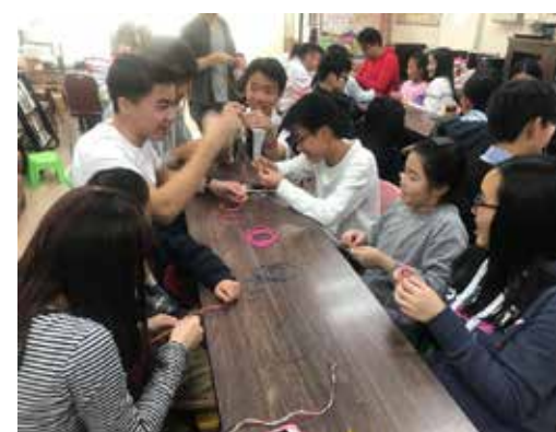
February 2018 – Community service project at Windshield Charitable Foundation, Ping Shek, coorganised with Ying Wa College Hong Kong