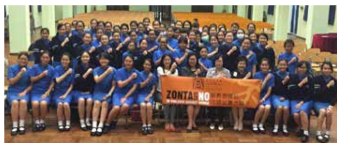
November 2016 – Installation Ceremony at HYS School Hall

Aiming to promote the club to the whole school, HYS Z Club kicked off the 2017-2018 academic year with an assembly promotion and a board display at the school entrance with the empowering message that everyone of them can be female figures that change the world. A movie sharing was held in November 2017 and the movie was Beauty and the Beast, followed by a discussion on the symbols in the movie. To honour International Women's Day, chocolate and stickers with motivational quotes were given out in the morning at the school entrance. Continuing their passion to serve the community, a service project was carried out in February in which students made bracelets and fai chuns with low-income families.