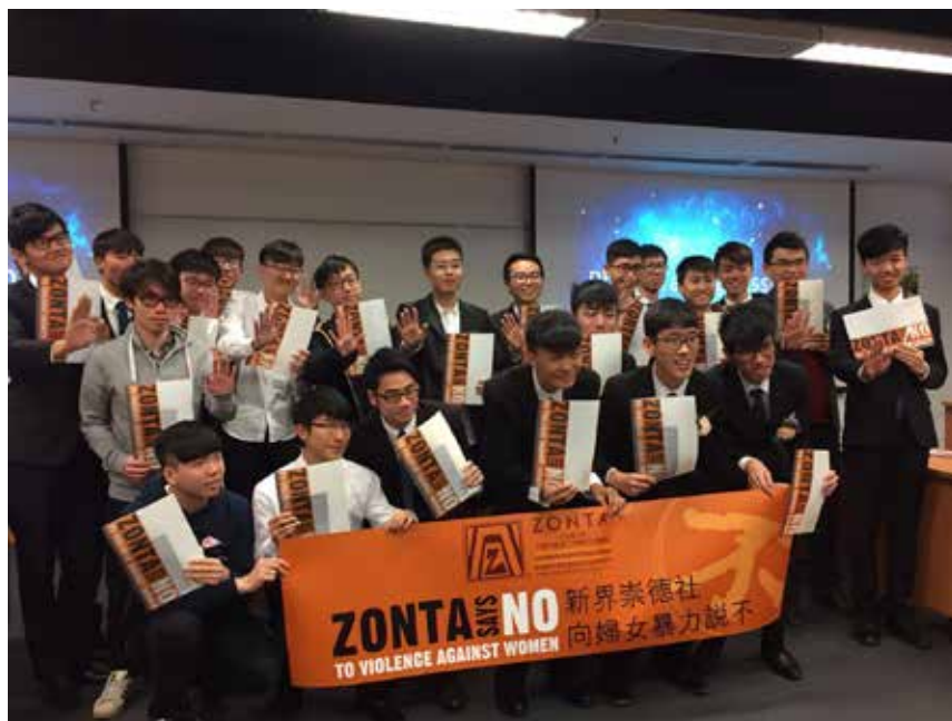
“Zonta Says No to Violence” seminar to university students in Chinese University of Hong Kong