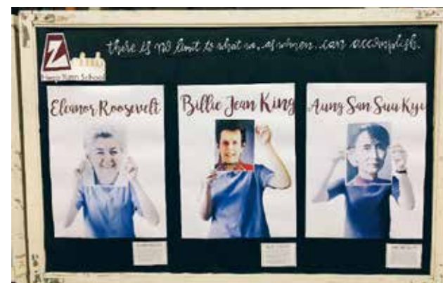
October 2017 – Assembly promotion and bulletin board display