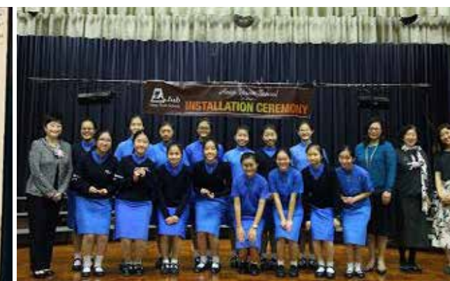
October 2017- Installation Ceremony at HYS School Hall