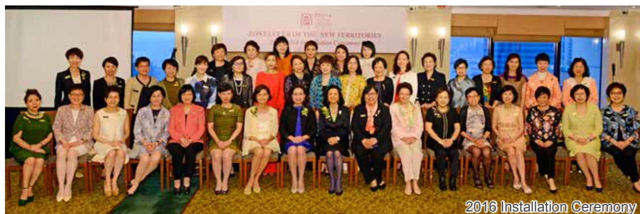
2016 Installation Ceremony