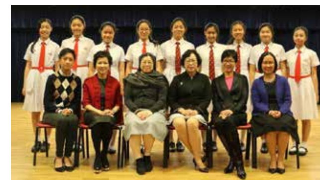
November 2016 – Installation Ceremony

On 23 and 24 March 2018 at the school’s Fun Fair, the Z Club held an escaping game. Through various mini games in the haunted room, students learned the importance of serving and helping others, and were encouraged to strive for their dreams when facing obstacles.