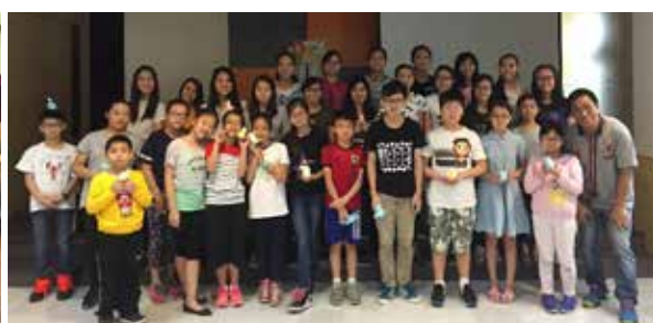
November 2016 – Community service project at Gilead Social Social Service Centre, Sai Wan Ho