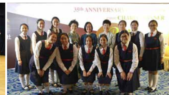
November 2017 – Zonta NT 35th Anniversary Celebration cum Charity Dinner