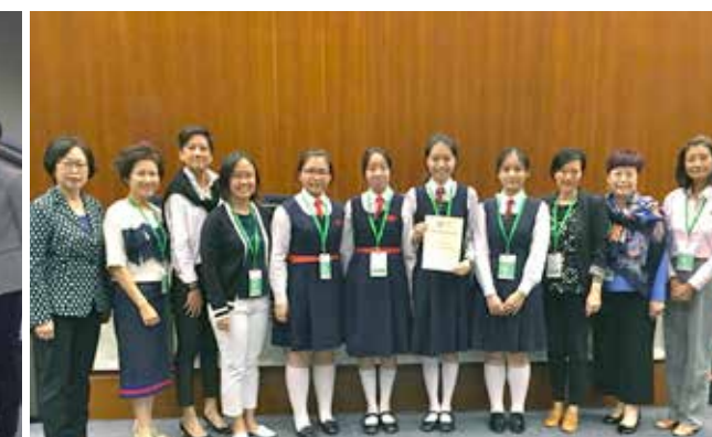
April 2018 – Legislative Council Mock Debate