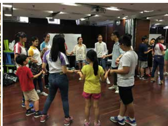
July 2017 – Community service project at HKFYG Jockey Club Ping Shek Youth S.P.O.T., coorganised with Sacred Heart Conossian College and Good Hope School