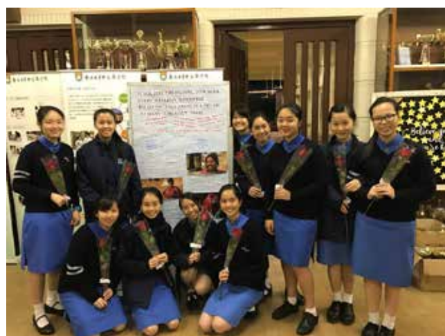
March 2017 – Celebration of International Women's Day – distribution of roses and bulletin board display on child marriage in Nepal