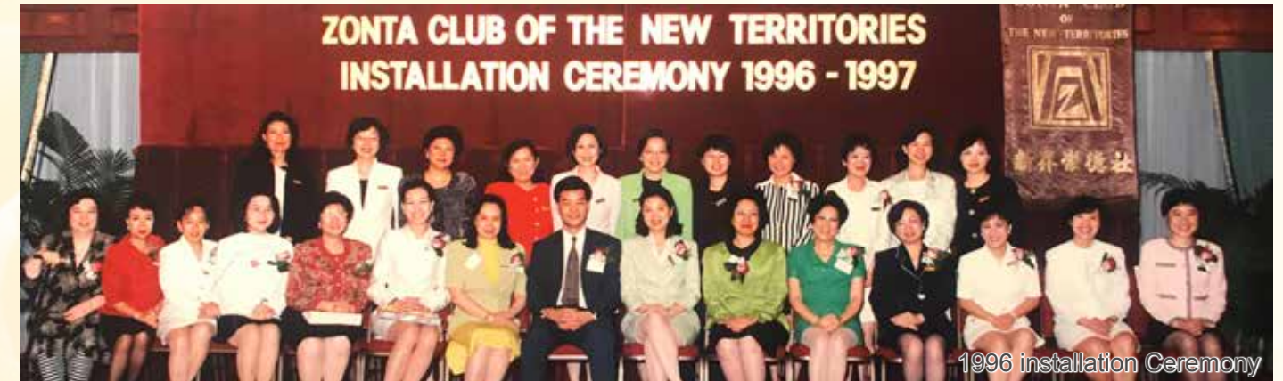
1996 installation Ceremony