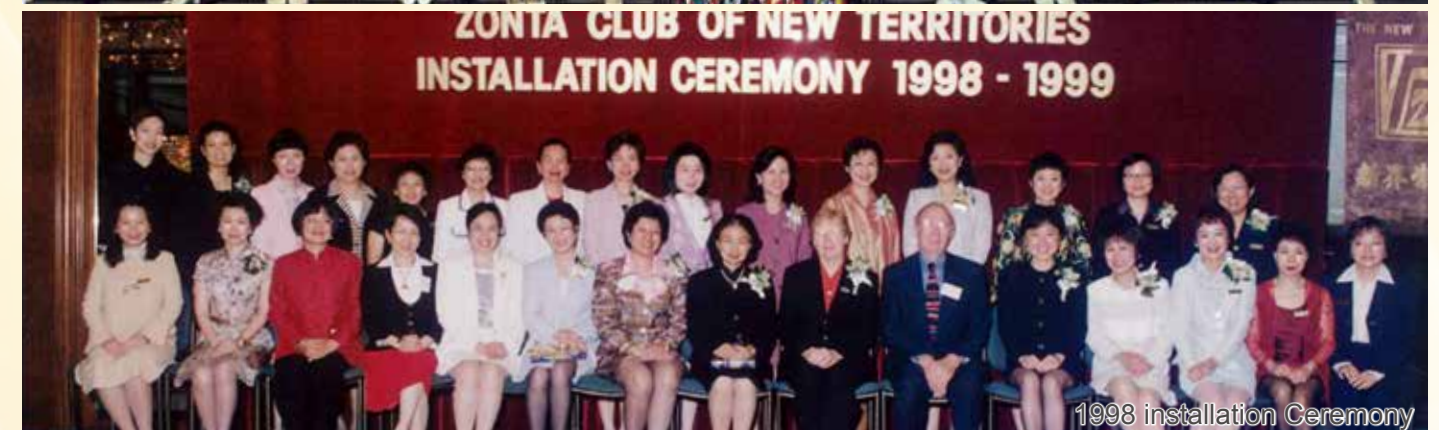
1998 installation Ceremony