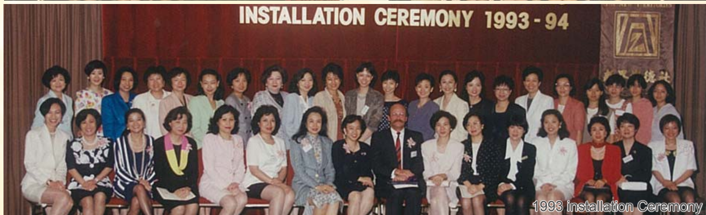
1993 installation Ceremony