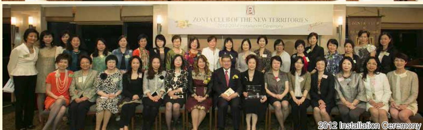
2012 Installation Ceremony