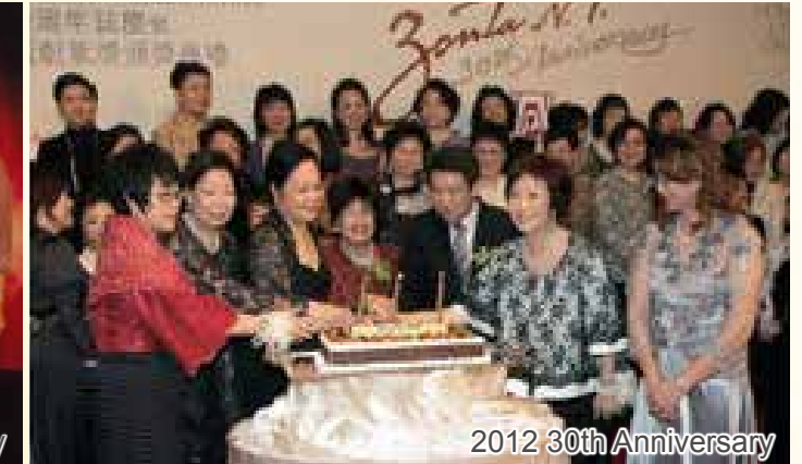
2012 30th Anniversary