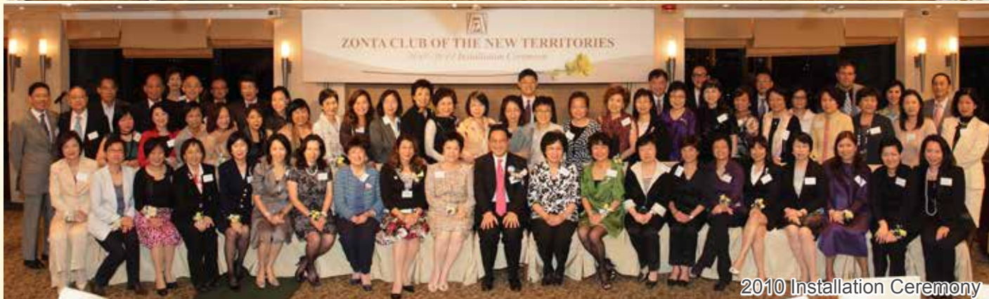
2010 Installation Ceremony