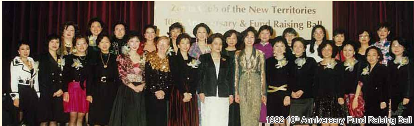
1992 10 th Anniversary Fund Raising Ball