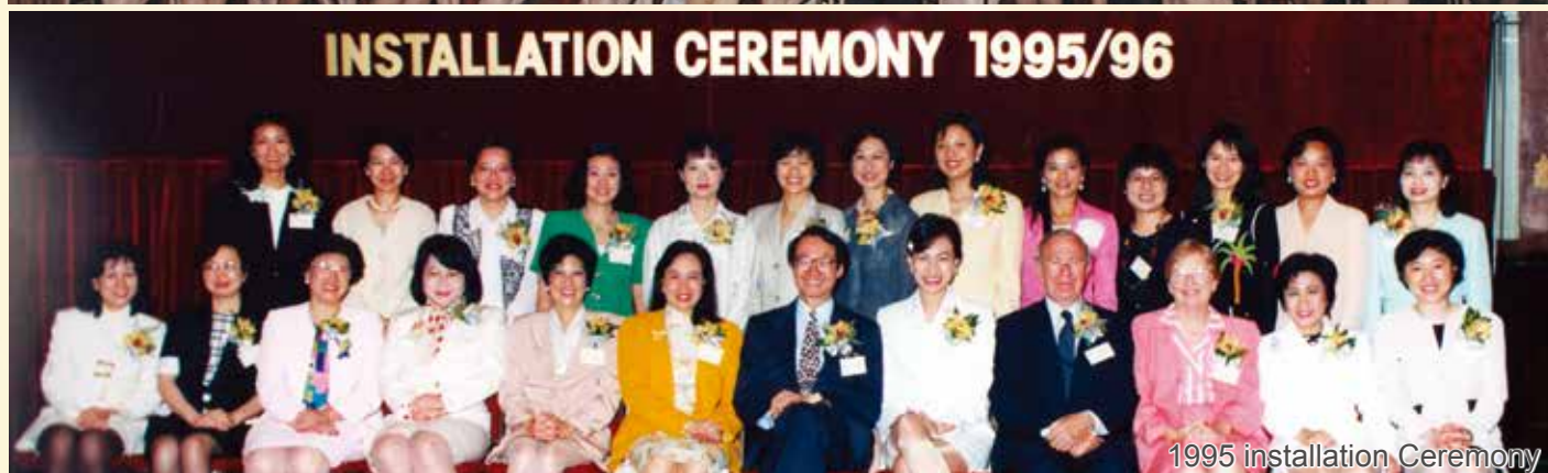
1995 installation Ceremony