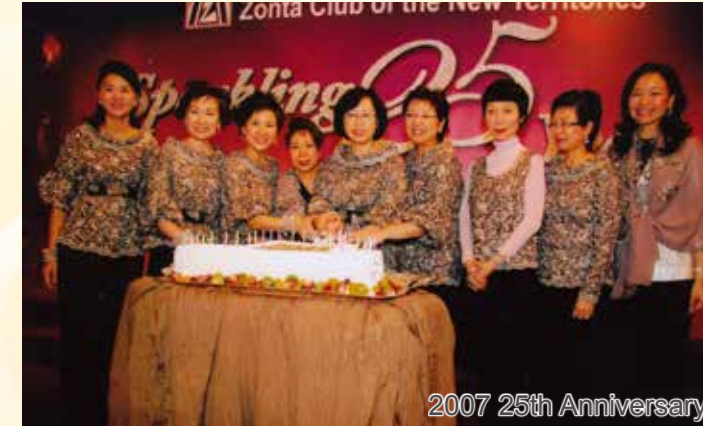
2007 25th Anniversary