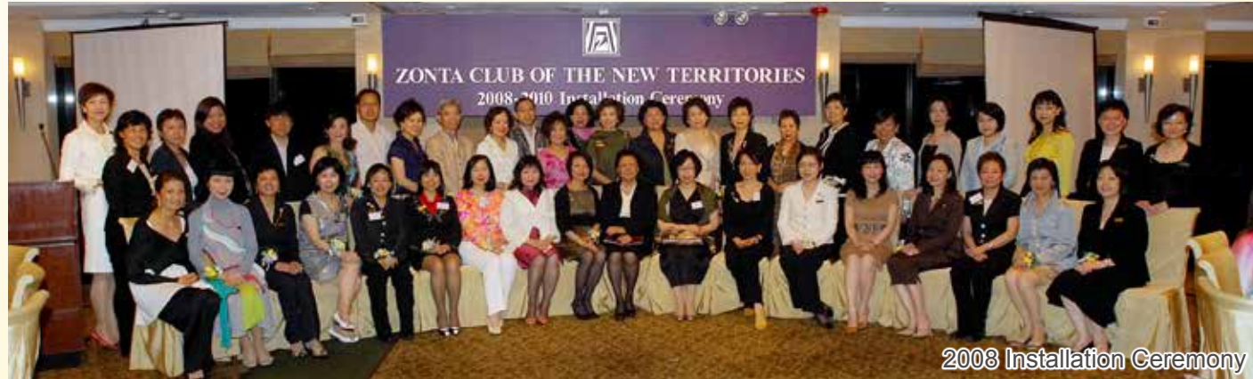
2008 Installation Ceremony