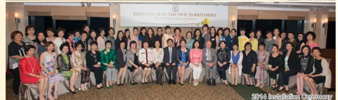
2014 Installation Ceremony