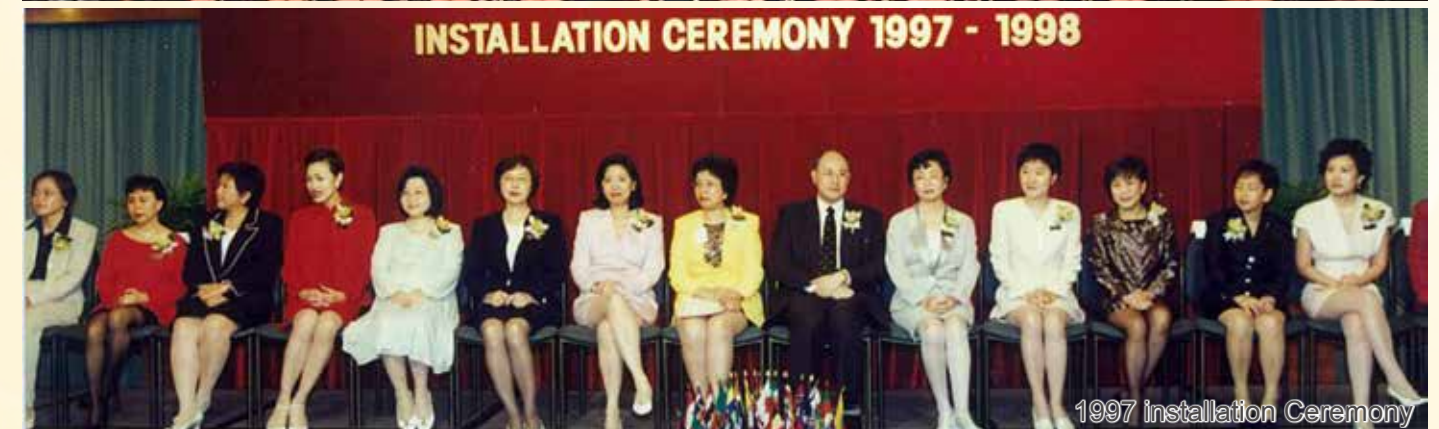
1997 installation Ceremony