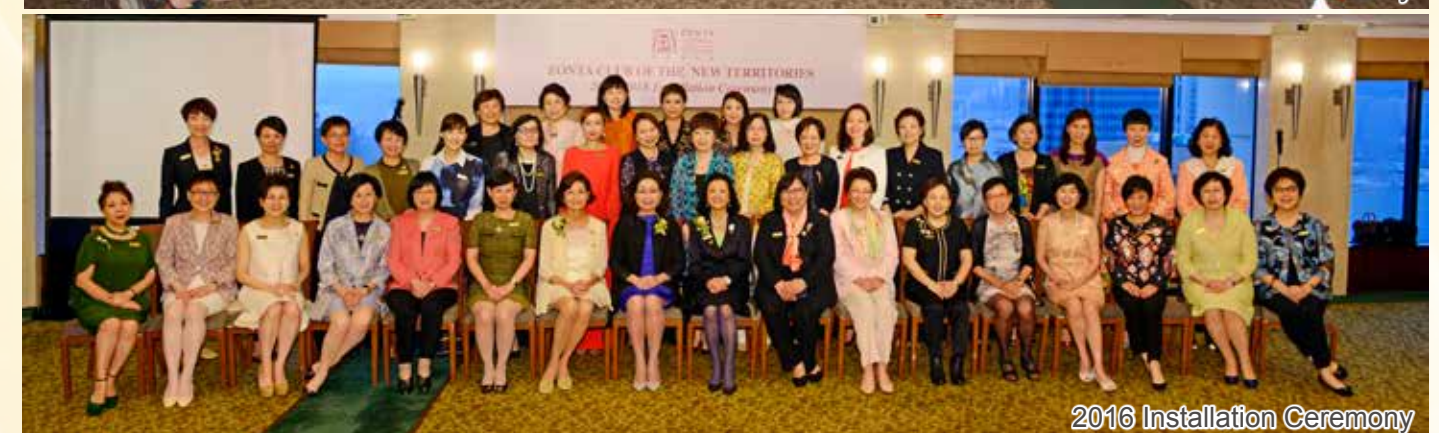
2016 Installation Ceremony